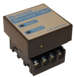
Brentek P8-WDT24/PLC Watchdog Timer with (gold) adjustment screw

Brentek Field-Adjustable Timeout Watchdog Timers allow the range of time-out period adjustment to be specified. Timing ranges are specified by the beginning point and the end point – typically, minimum and maximum timeouts being 50 milliseconds and 60 seconds – consult the datasheet for timeout ranges available for your particular model of watchdog timer.