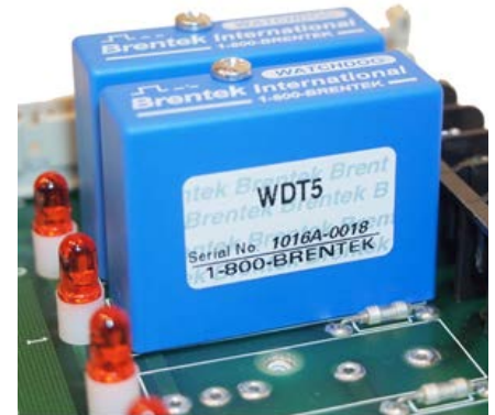
Watchdog timers easily integrate with Industrial I/O Control Systems

Alarming is generally used along with other watchdog functions and is common in applications where a human operator must determine why a computer fault occurred and manually clear the alarm. A good example is a controller for a hydroelectric power plant. Regulation of turbine flow and other parameters likely requires PID (proportional integral